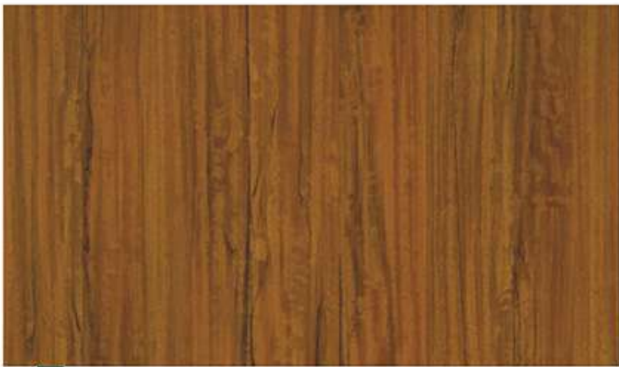
4954 PWU GREEK BARK