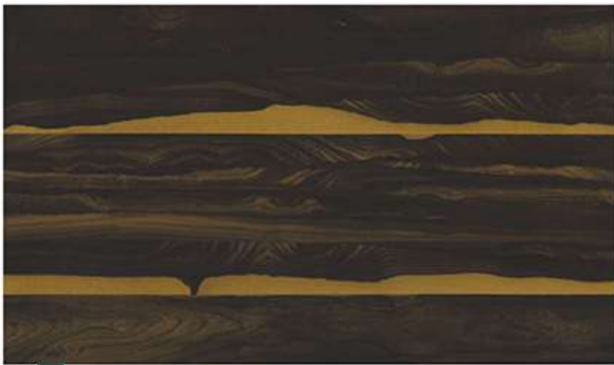
4976 PWU DARK VERVE