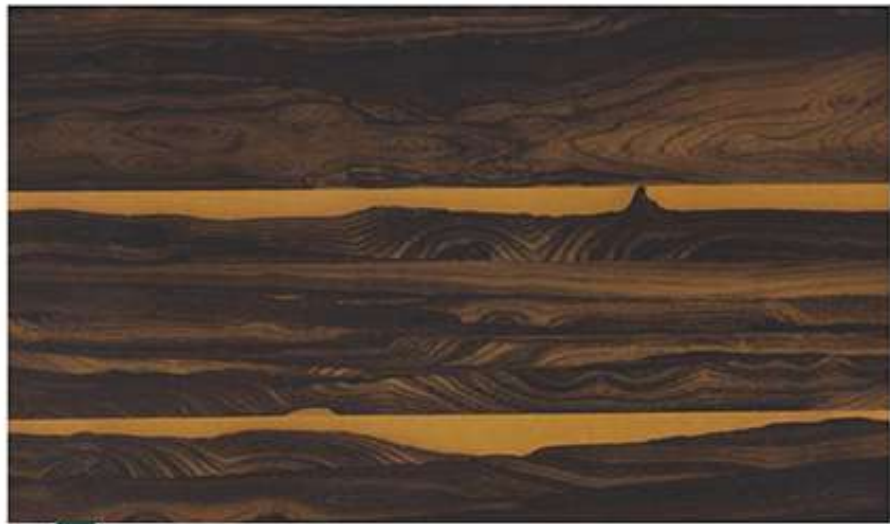
4978 PWU STORMY VENZA

Wooden surfaces by Virgo, let's you experience the grace of nature in your place with least efforts.