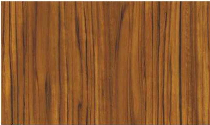
4956 PWU GOLDEN GRAIN