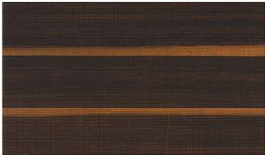
4980 PWU WOODEN TRAIL